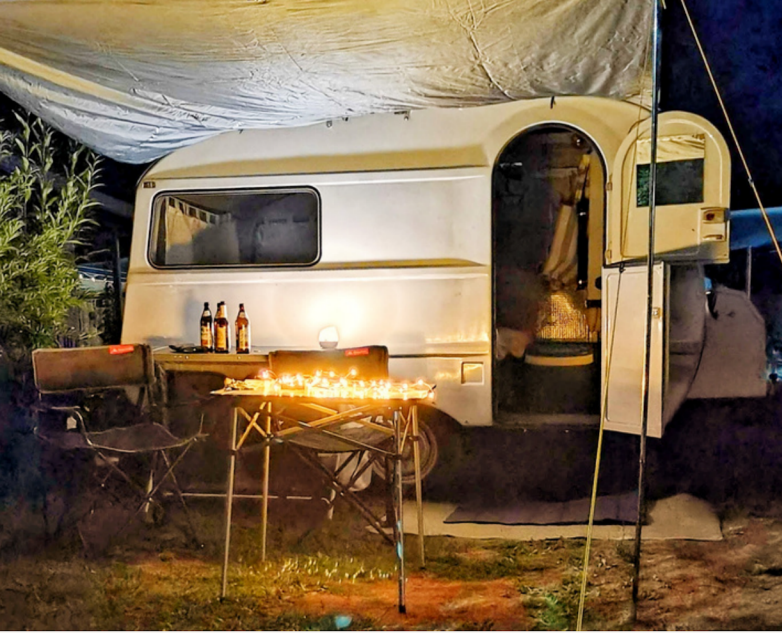
Our small GDR-Camper